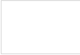
White - DTSW02