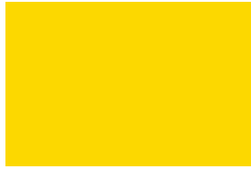
Yellow - DTSW05