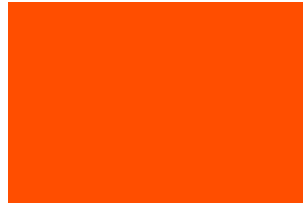
Orange - DTSW04