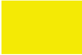
Yellow - BLN03