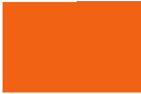
Orange - BLN02