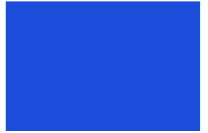
Blue - BLN05