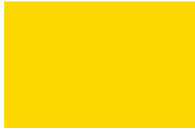
Yellow - DTSW05